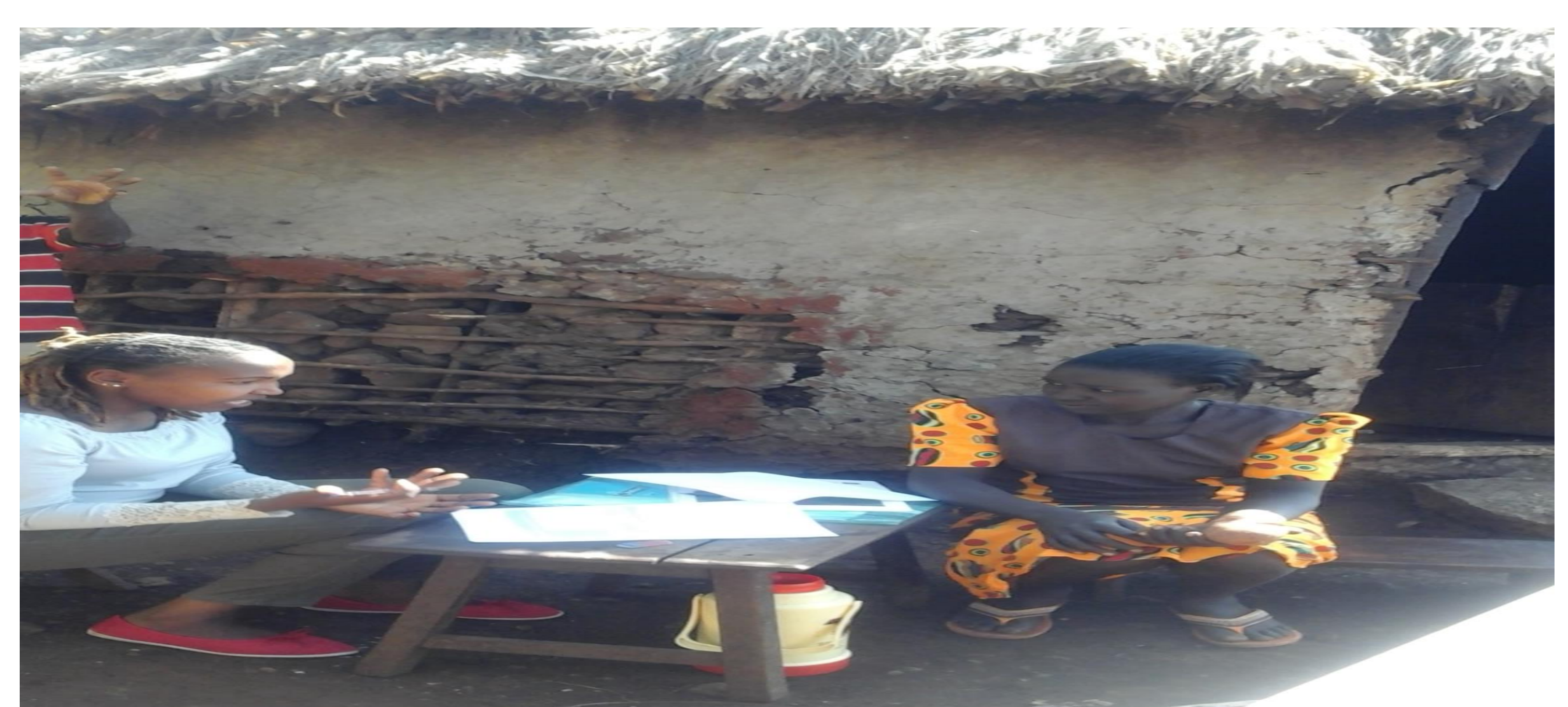
Figure 2. Interview of respondents by enumerator

Study area: Bungoma and Nyandarua County. Participatory Research – Learning from farmers’ experiences through a household survey. Figure 2 shows an enumerator administering a questionnaire to an Irish potato farmer. Descriptive statistics and Poisson regression model were used to present data from this study.