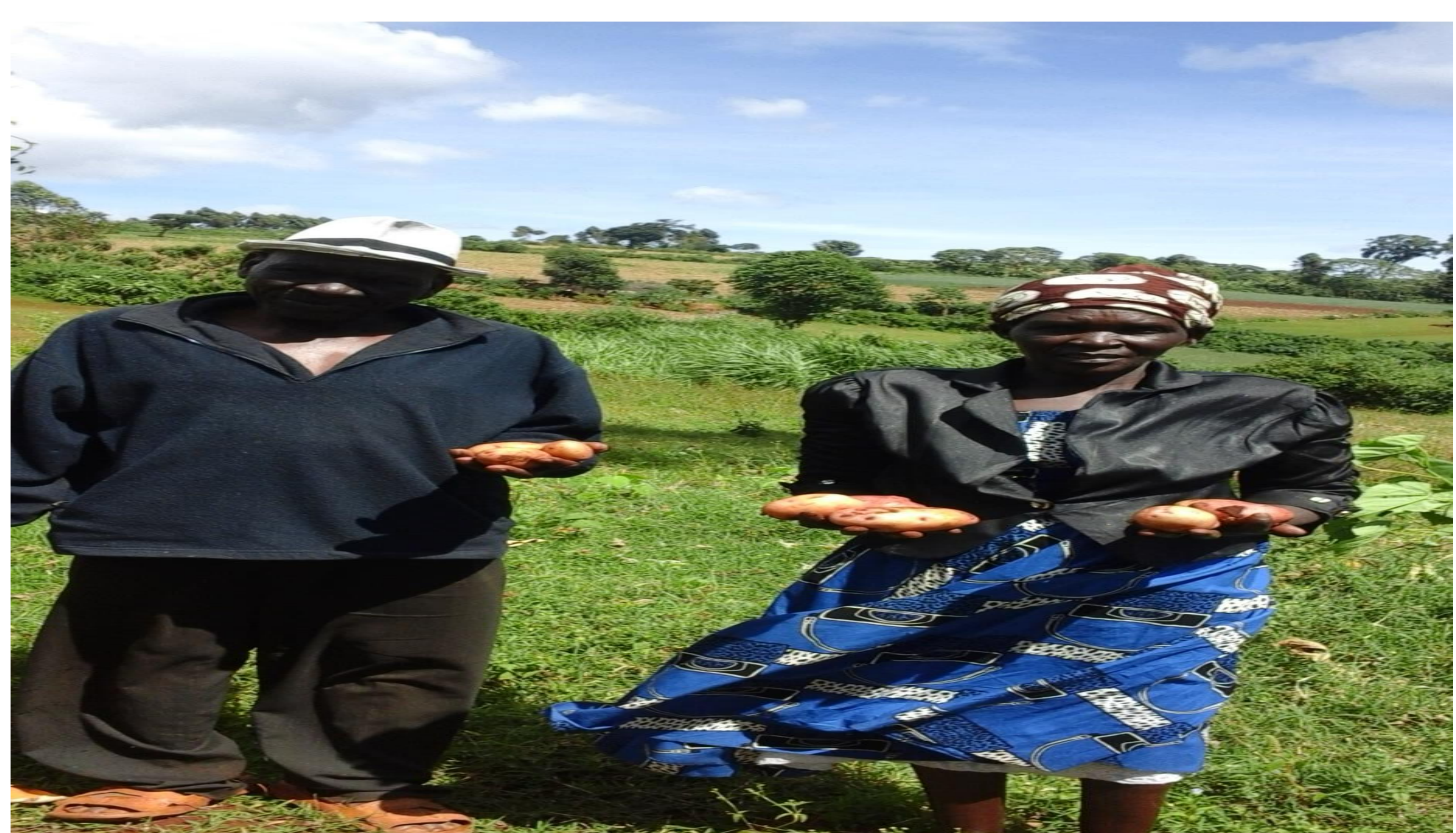
Figure 1: Potato Farmers in Bungoma

Irish potato is the top most consumed commodity under the non-grain foods in the world with an estimated production of 376 million tons (FAO, 2019). The current Irish potato yield is not sufficient to meet the demand in the rural areas. There are only a few farmers who engage in commercial production of Irish potato. This study seeks to assess the factors influencing the use of GAPs by Irish potato farmers in Kenya. We believe that socio-economic characteristics influence the use of good agricultural practices among Irish potato farmers in the study area. Figure 1 shows a farmer in Bungoma County where I sort to identify key issues along the Irish potato production.